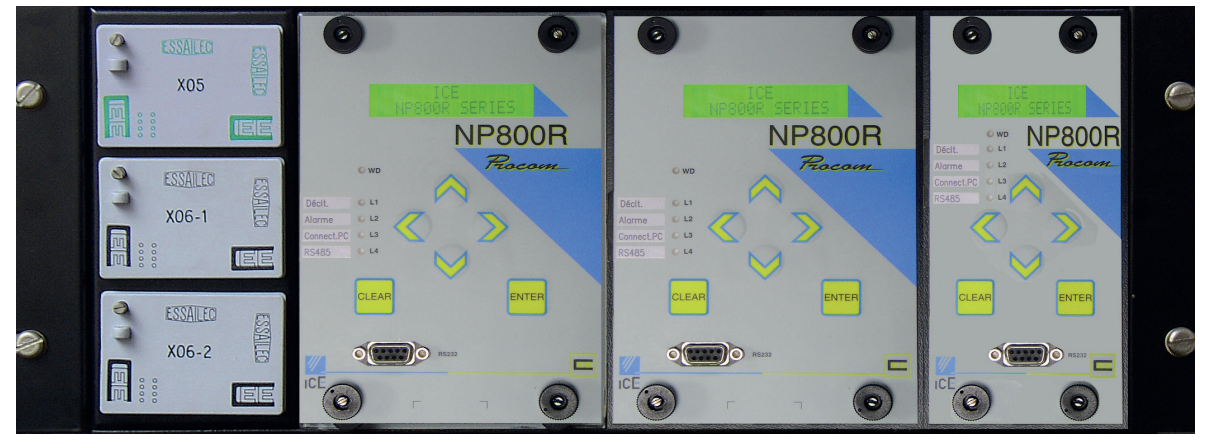
19" rack mounting