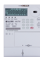
Mk7M Class 1 WC Disconnect Relay