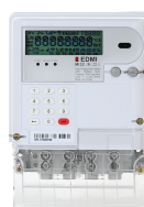
Mk32 Class 1 & 2 WC Keypad & Dual Disconnect Relay