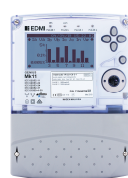
Mk11 Class 0.2S CT Power Quality