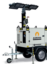
LIGHTING TOWERS WITH ENGINE