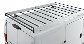
EQUIPMENT FOR COMMERCIAL VEHICLES