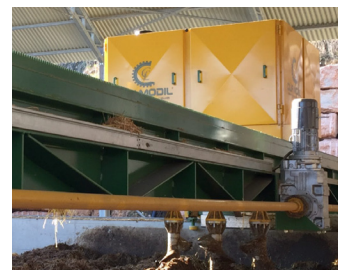
CLF MODIL - MIXING AND OXYGENATION