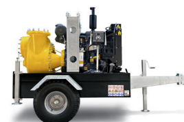
DEWATERING E INDUSTRY