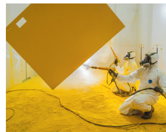
POWDER COATING OF METALS