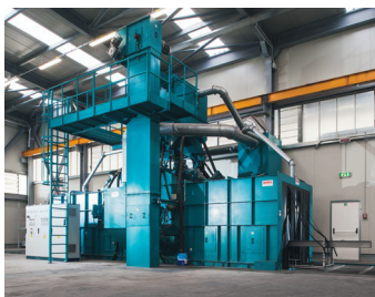
SANDBLASTING OF METALS