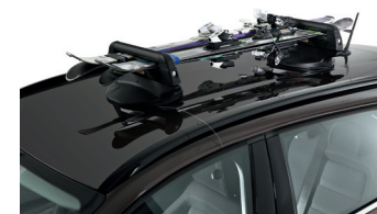
SKI RACKS AND CAR ACCESSORIES