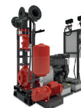
FIRE FIGHTING SYSTEMS