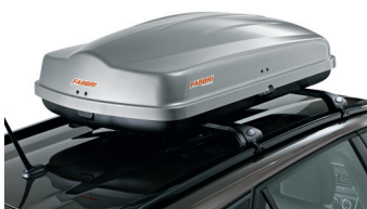
ROOF BARS AND ROOF BOXES