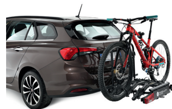
TOWBAR, TAILGATE AND ROOF BIKE CARRIERS