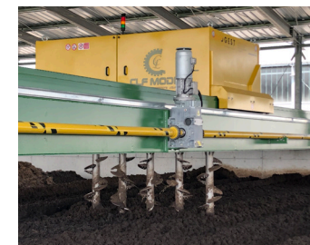
CLF MODIL - MIXING OF THE SOIL IMPROVER AFTER COMPLETION