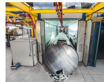
LIQUID PAINTING OF METALS